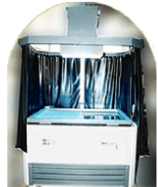
Plate Exposing Systems