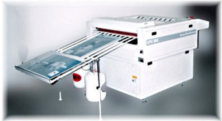
Plate Processing Systems